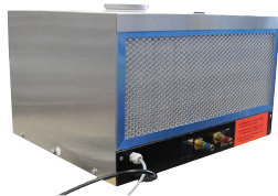
ORBICOOL Active (front view)

* ORBIMAT 165 power sources must be retrofitted at the factory