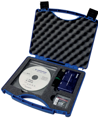
Soft-/Hardware package "CA"