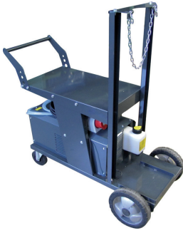
ORBICAR W trolley with integrated liquid cooling