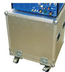
Storage and shipping case 165/300