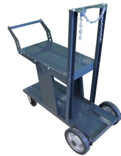
ORBICAR S trolley

Not suitable for use in combination with the compressor cooling device ORBICOOL Active.