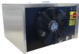
ORBICOOL Active (rear view)

The device includes 2 cans, each with 3.5 liters (0.92 gal) of the OCL-30 coolant (see page 17). Suitable for all* ORBIMAT orbital welding power supplies). Not suitable for use in combination with the ORBICAR S trolley.