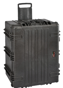
Storage and shipping case 180 SW