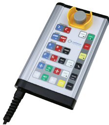
Remote control with cable