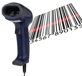
Bar code/QR code scanner SW